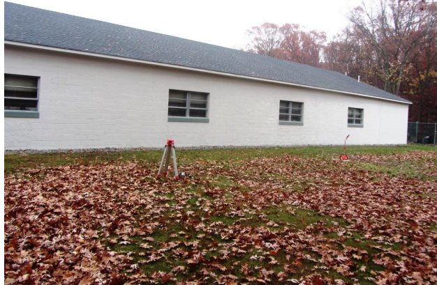
Mountain Lakes Department of Public Works Building, Mountain Lakes, Morris County, NJ.

The Township of Mountain Lakes is situated within the Troy Brook watershed. The Mountain Lakes DPW facility is participating in reducing stormwater runoff to the Troy Brook. Addressing the Mountain Lakes DPW yard stormwater runoff can assist in improving water quality in the Troy Brook since this facility is upstream of the Parsippany-Troy Hills DPW. The majority of runoff from this site flows into a healthy, wooded area on the northern area of the parcel naturally allowing for disconnection, treatment, and infiltration. The primary source of runoff entering the storm sewer system is from the roof of the DPW building. Intercepting the runoff with a rain garden is one opportunity for managing the stormwater onsite. Mountain Lakes has been identified in the Troy Brook Regional Stormwater Plan as an area where recharge should be encouraged.