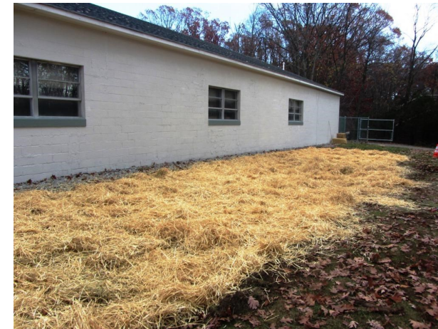
Hay was placed over the excavated garden to maintain the soil and prevent erosion until planting in the spring.

The roof drainage to the rain garden is 1,820 ft 2 , and the rain garden treats a large part of the impervious foot print of this facility. The driveways and buildings were the only impervious surfaces that provided runoff that reached the stream. This rain garden captures the runoff from the entire roof.