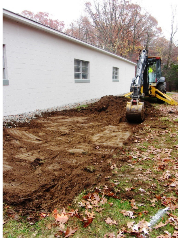
Excavation was conducted by the staff of the Mountain Lakes DPW allowing for significant cost savings.

Rain gardens are shallow, landscaped depressions that capture roof, driveway, or parking lot runoff from frequent small storm events. The captured stormwater is allowed to slowly seep into the ground, recharging the groundwater, while the soil and plants filter out pollutants. This infiltration reduces the amount and velocity of stormwater that enters the stream. The rain garden was installed in the back of the building to allow for the disconnection of the roof runoff.