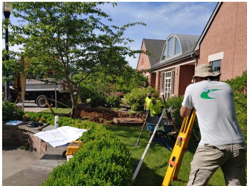
Bernardsville Public Library construction, Bernardsville Borough, NJ, June 2020

On June 15, 2020, the Rutgers Cooperative Extension (RCE) Water Resources Program completed the installation of a rain garden at the Bernardsville Public Library. The Bernardsville Department of Public Works assisted with the heavy lifting during the excavation. This rain garden opportunity was identified via funding provided by the New Jersey Highlands Council to complete an impervious cover reduction action plan for Bernardsville Borough. The managed drainage area for the rain garden is 840 square feet. The rain garden is 215 square feet in size and will serve as a demonstration project for residents that want to install rain gardens at their homes. The rain garden will capture, treat, and infiltrate approximately 13,380 gallons of stormwater runoff per year.