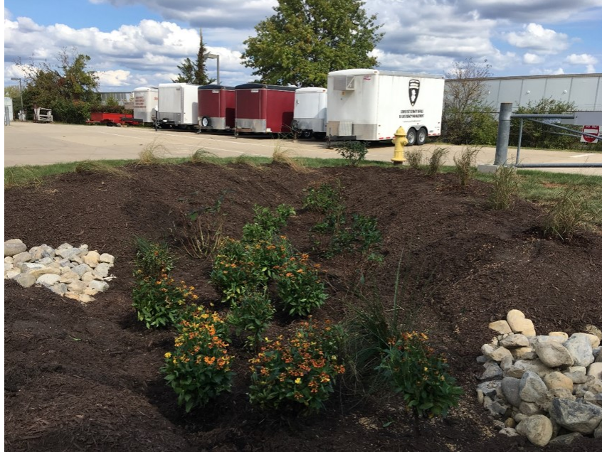
Somerset County OEM rain garden, October 2020