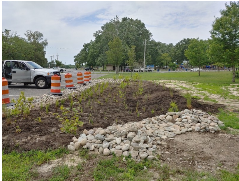
Hammonton Canoe Club rain garden, July 2020

together to excavate the rain garden area, add bioretention media, spread the mulch, and install the plants. The installation was completed on June 23, 2020. The managed drainage area for the rain garden is 5,220 square feet. The rain garden is 980 square feet and will serve as a perfect example for residents that want to install rain gardens at their homes. The rain garden will capture, treat, and infiltrate approximately 91,630 gallons of stormwater runoff per year.