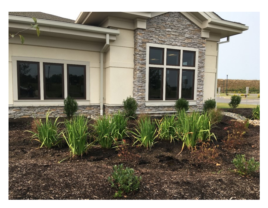
Monroe Senior Center rain garden, September 16, 2020

used to install these rain gardens. Wogisch Landscape Contractors, Inc. excavated for the rain gardens, added bioretention media, spread a 3-inch layer of mulch, and installed the plants. The managed drainage area for the two rain gardens is 6,780 square feet. One rain garden is 910 square feet, and the other is 770 square feet. They will enhance the aesthetics at the entrance of the Senior Center while attracting and nurturing pollinators. The rain gardens will capture, treat, and infiltrate approximately 109,680 gallons of stormwater runoff per year.