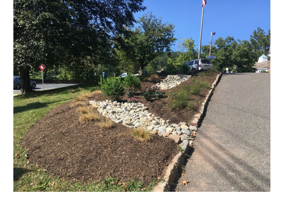
Watchung Rescue Squad rain garden, September 21, 2020