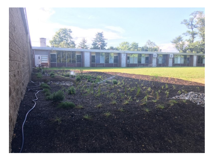
Automatic sprinkler in use at Grace Breckwedel Middle School following the installation of plants, August 1, 2020

The Water Resources Program was awarded a 319(h) grant from the New Jersey Department of Environmental Protection to implement green infrastructure projects in the Raritan River watershed. Funds from the grant were used to design and install the rain garden at the Grace Breckwedel Middle School in July 2020. Wogisch Landscape Contractors, Inc. excavated the rain garden area, added bioretention media, and spread a 3-inch layer of mulch. Students and staff from the school assisted the Water Resources Program with planting. The managed drainage area of the rain garden is 6,030 square feet. The rain garden is 1,200 square feet in size and will serve as a demonstration project to residents of how they may incorporate green infrastructure on their property. Most importantly, the rain garden will be used as an educational tool for teachers to include in lesson plans. The rain garden will capture, treat, and infiltrate approximately 104,000 gallons of stormwater runoff per year!